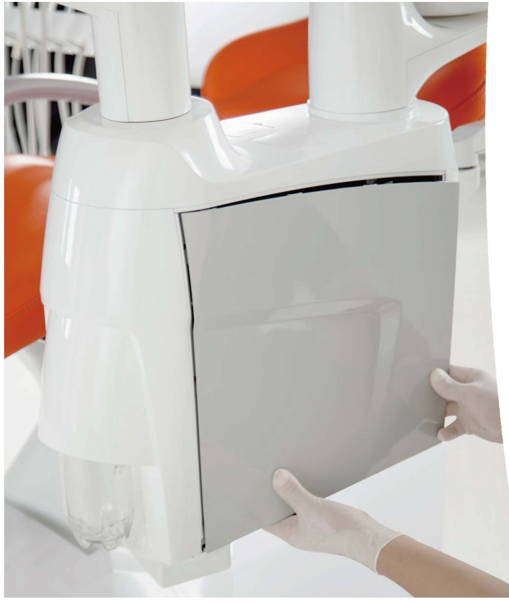
Detachable sidebox cover, easy for maintainance. One key spittoon flushing, intellgent desinfection.