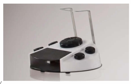
The luxury multi-functional pedal can control the operation lamp & tumbler filling.