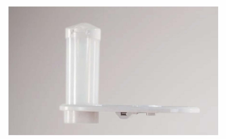
3 in 1 tray USB universial charging port .