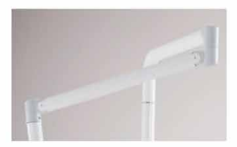
WINQ Italian hanged type lamp arm, flexible and light.